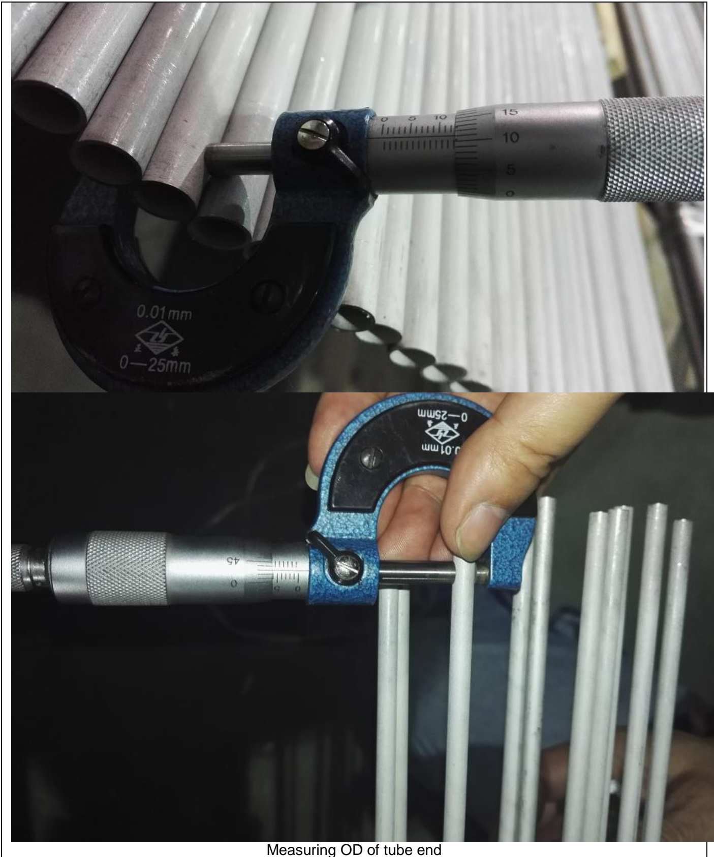
Measuring OD of tube end